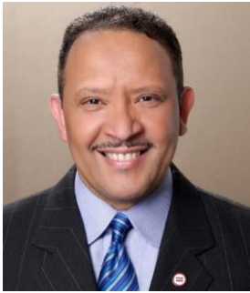
President and CEO National Urban League